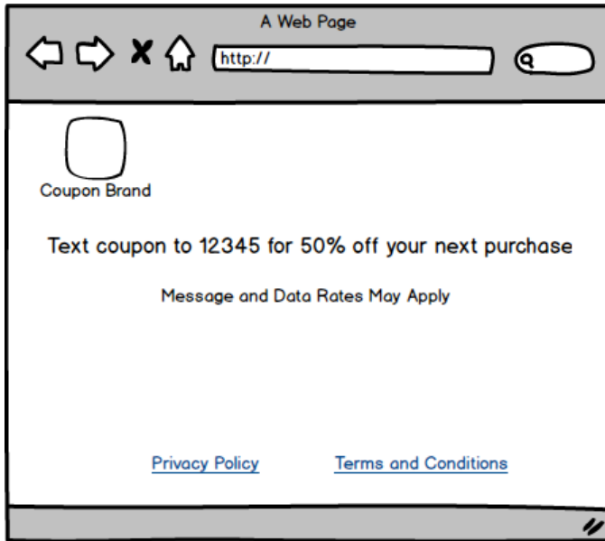
Exhibit A1: Sample Compliant Single-Message Advertisement and Service Messages